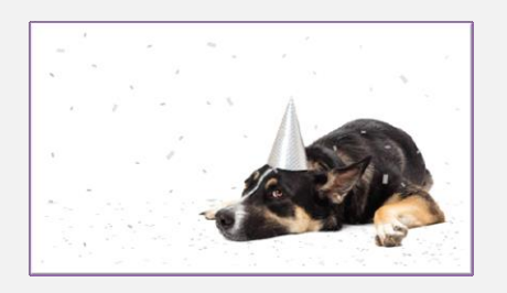
Sorry to be a party pooper..... but at this time we cannot allow birthday cakes to be brought into school.

Class 1 have been working very hard to collect words and write sentences.