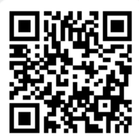
scan the QR code with your phone's camera for Parent Guides on how to help keep your children safe online

They feel they can't turn to parents or a trusted adult for support as they fear they may get in trouble or have their devices taken away from them. It can carry on all day, all evening and all weekend for the world to see, causing a lot of emotional stress to the victim and their family.