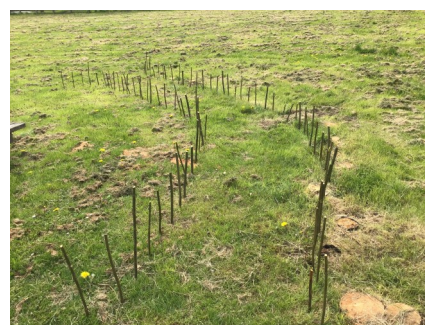
Replanted willow arch.