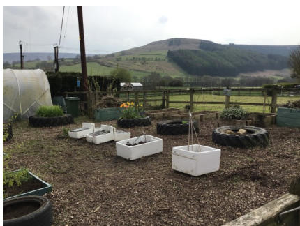
Garden area ready for gardening club.