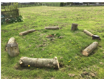
Renewed fire circle.